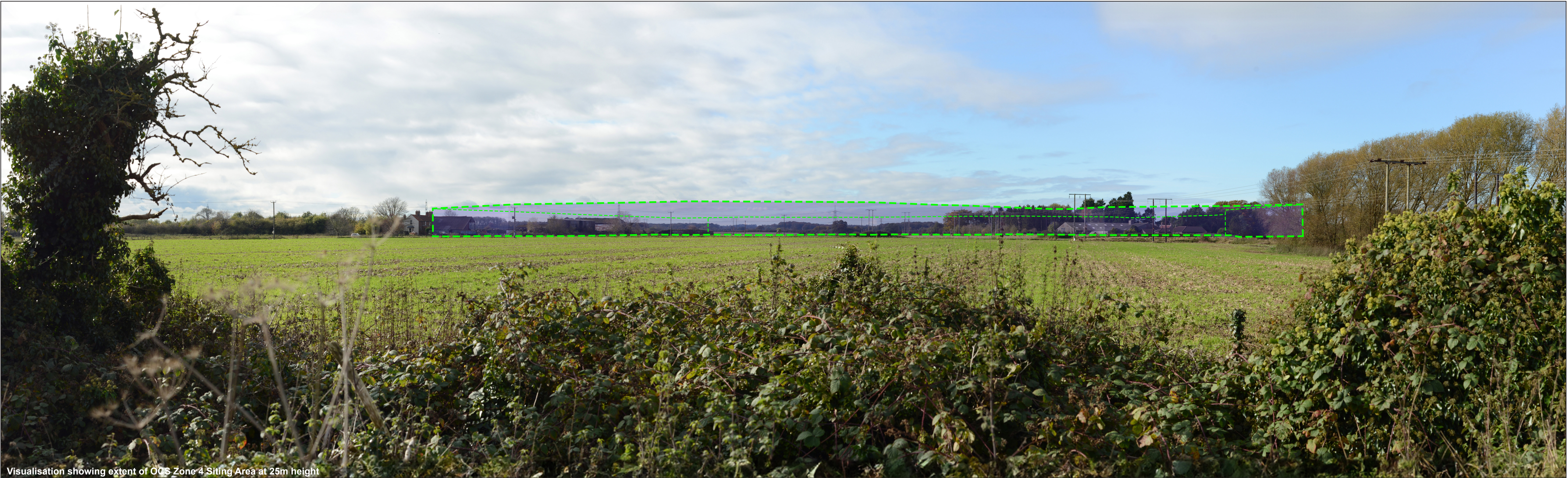
Visualisation showing extent of OCS Zone 4 Siting Area at 25m height