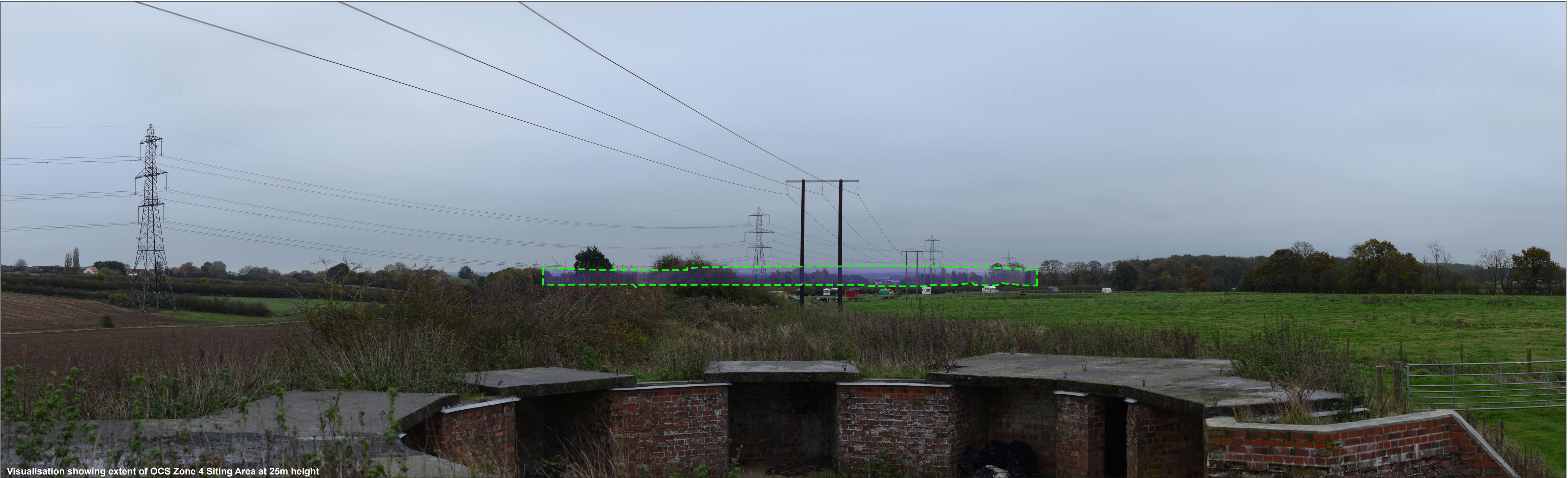
Visualisation showing extent of OCS Zone 4 Siting Area at 25m height