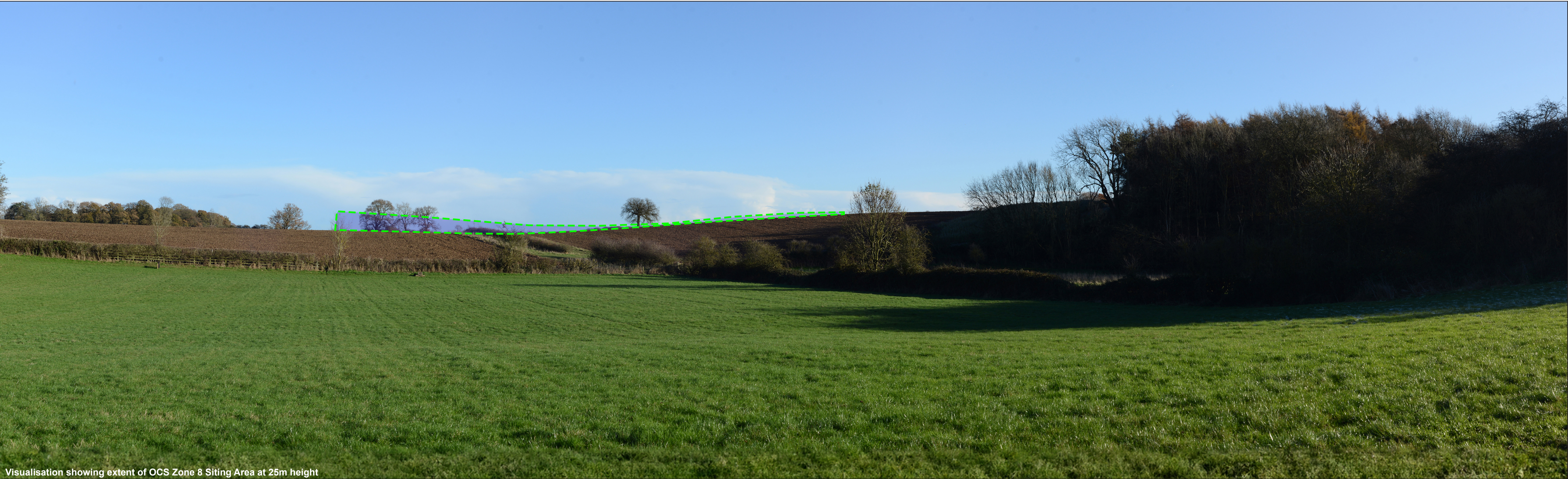
Visualisation showing extent of OCS Zone 8 Siting Area at 25m height